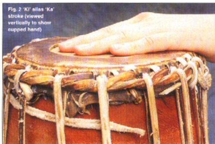
Fig. 2 'Ki' alias 'Ka' stroke (viewed vertically to show cupped hand)