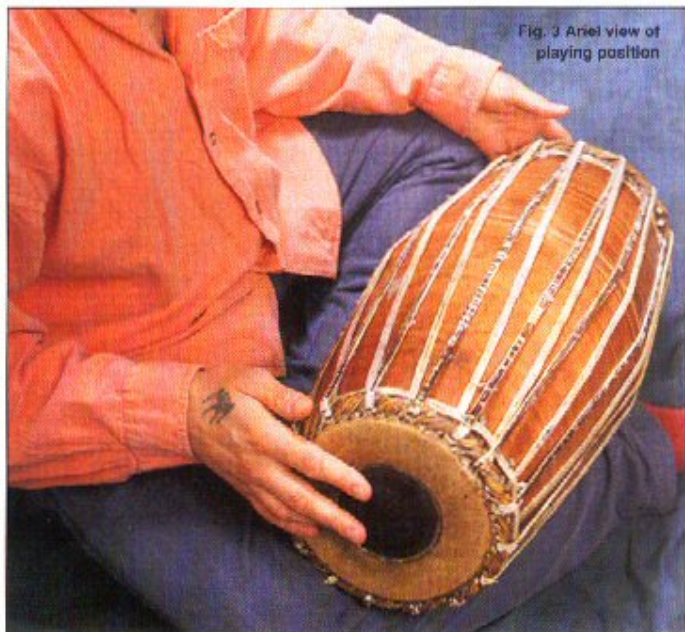
Fig. 3 Aerial view of playing position