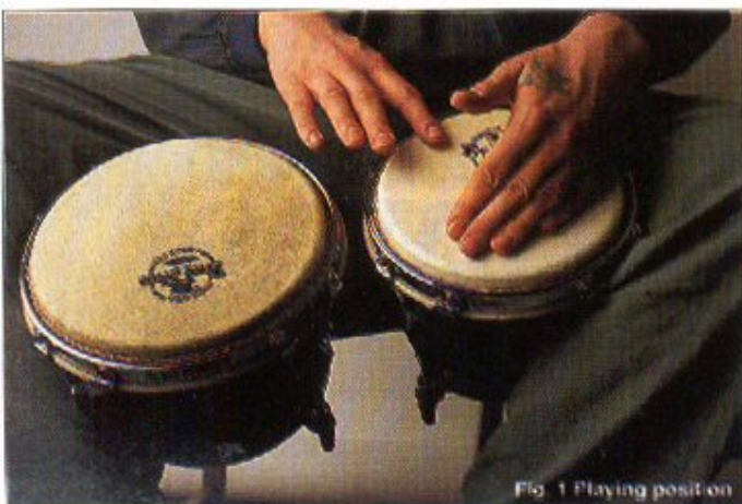
Fig. 1 Playing position on