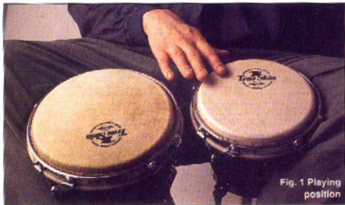
Fig. 1 Playing position

It is most common for the bongos to be played sitting down, although it is also perfectly admissible to stand-mount them. If we look at Fig. 1 we can see the way the drums are held between the legs. This really is a case of finding the most comfortable position for you. They're not necessarily comfortable drums to play, and the bolts can dig into your legs. I get around this by loosening the whole tuning carriage and positioning the bolts so they fall in the crease of the leg behind