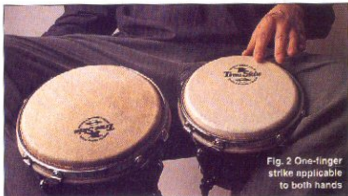
Fig. 2 One-finger strike applicable to both hands