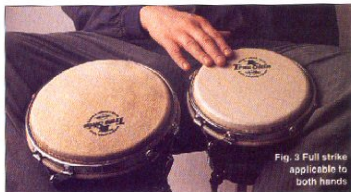
Fig. 3 Full strike applicable to both hands

You will also see from the photo that the drums are angled slightly downwards. All these points are subjective, but one thing that is absolutely necessary is that the playing surface does not fall below the knees. The heads have to be proud. This makes access to the playing surface easier and helps to avoid the player resting his arms on his legs, which must be avoided. One final note: for right-handed players, the larger drum should be on the right.