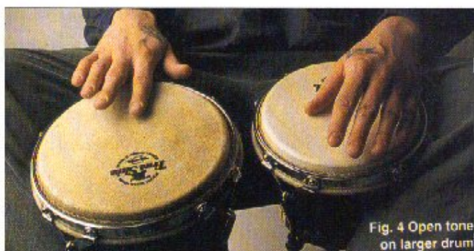
Fig. 4 Open tone on larger drum

Next we have the open tone on the larger drum. This is articulated with the first finger slightly more into the drum than for the small drum. This helps accentuate the bass tone by bringing out some of the lower harmonics. It is important not to hit the larger drum near the rim if you want to pull out the bass of the drum.